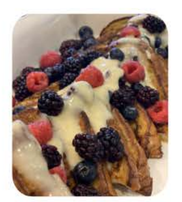
Challah French Toast

*All package items available a la carte*